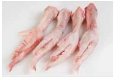
Feet (Short and Long Cut)