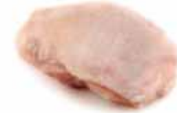
Thigh without backbone