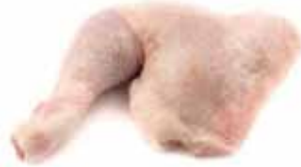
Leg quarter, tail-off (with or without skin)