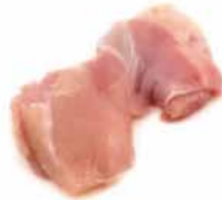
Thigh boneless, skinless