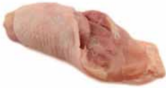
Thigh boneless, skin on