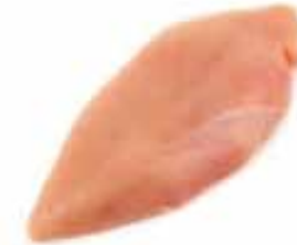
Breast fillet, with inner fillet, boneless, skinless