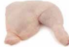
Leg quarter, tail-on (with or without skin)