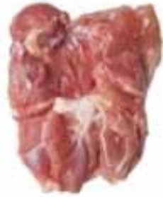
Leg meat (boneless, skinless)